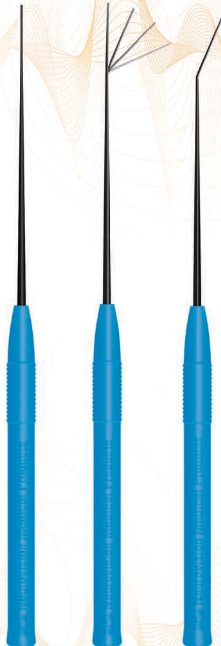
TAPERED TIP STIMULATION PROBE