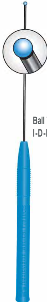
Ball Tip I-D-BTP90-5