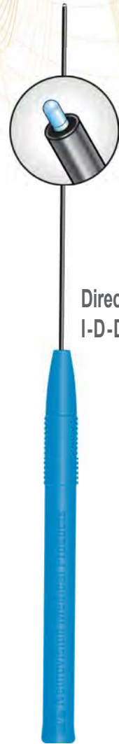
Direct Nerve I-D-DNP90-5