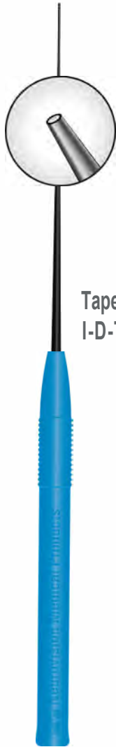
Tapered Tip I-D-TTP90-5